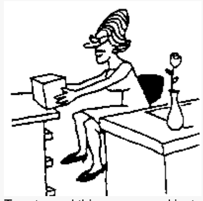
Turn toward things you need instead of reaching off to the side or pulling things toward you.