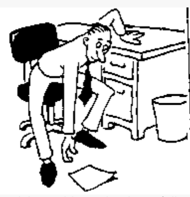
To pick up objects that have fallen to the floor, slide to the edge of you chair and place a hand on your knee or your